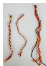
Friendship bracelets/anklets in the German flag colours: one of the German Week lunchtime activities.