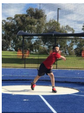
Laures - Discus